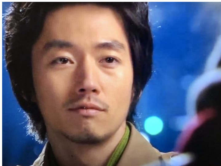
Mr George Wickham: Jang Hyuk, Robber

Jang Hyuk as Kwon Oh-joon, Robber (2007)