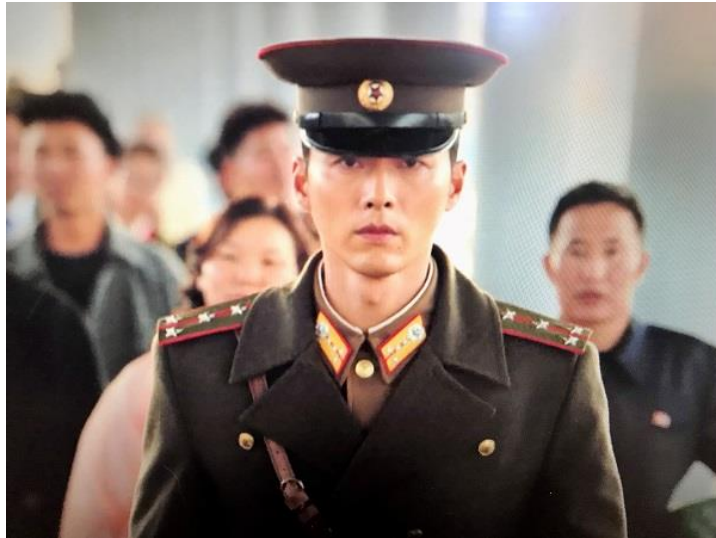
Mr Darcy: Hyun Bin, Crash Landing on You

Hyun Bin as Captain Ri Jeong-hyuk, Crash Landing on You (2020)