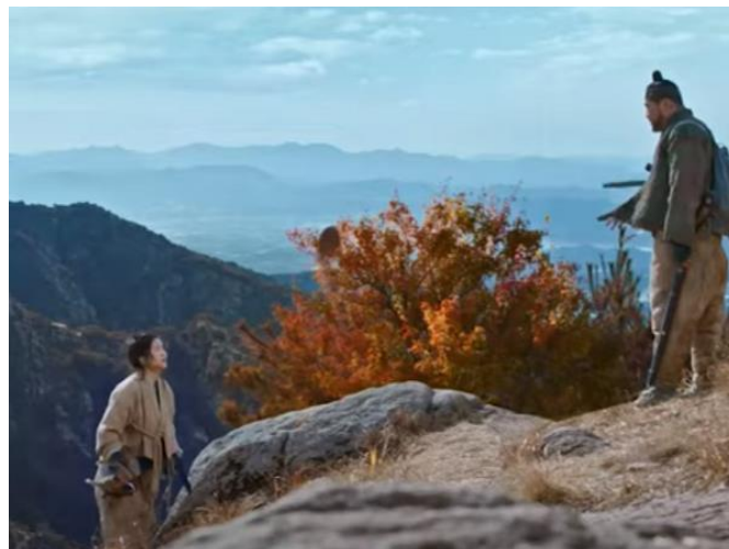
Pretty Korea: Mr Sunshine

Kicking off things, as all good stories should, is a beautiful setting. Like Mr Darcy's grander than grand home of Pemberley in Pride and Prejudice , kdrama makes good use of its filming locations to take our breath away. From its recreated historical buildings ( Empress Ki ), to its modern architecture ( The Greatest Love – the lead male's cool house is in fact a museum), to its sweeping landscapes ( Mr Sunshine ), to its blossom trees (any drama filmed in spring) and snow (any drama filmed in winter), yep, kdrama has its gorgeous settings down.