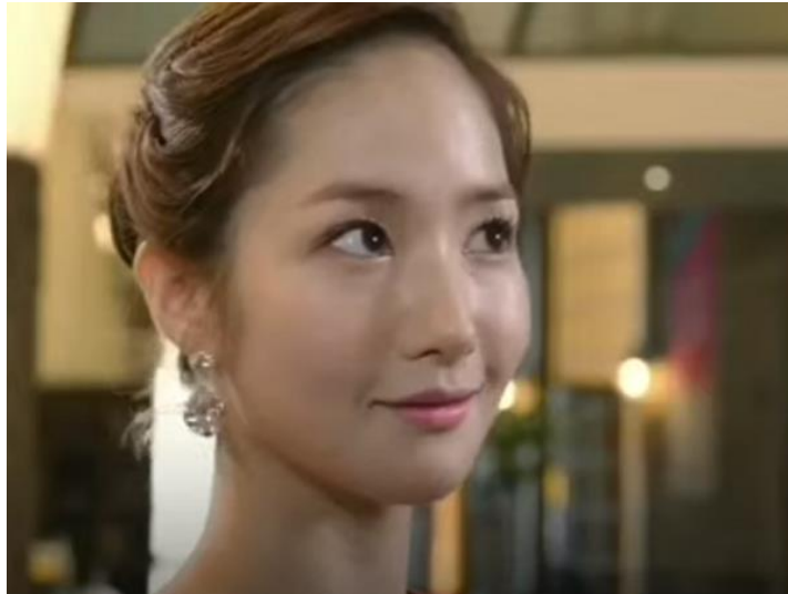
Elizabeth Bennett: Park Min-young, Healer

Park Min-young as Chae Young-shin, Healer (2015)