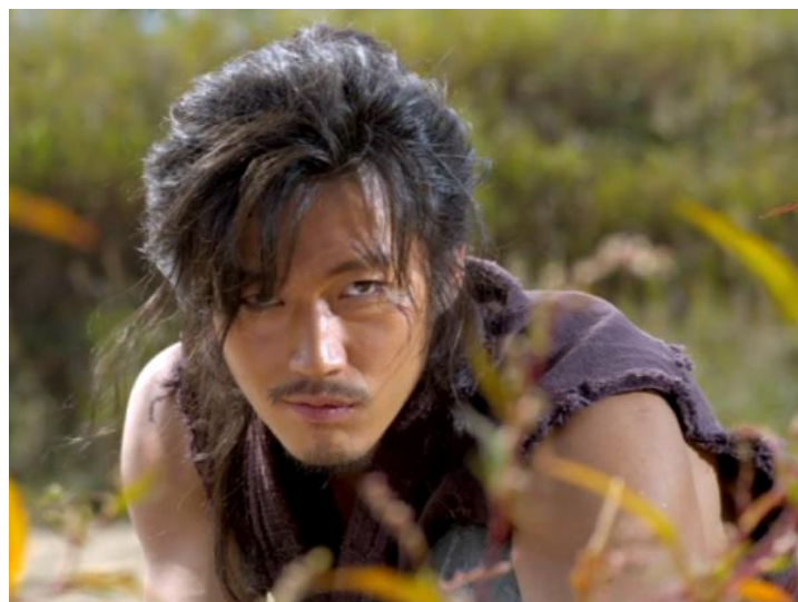
Great characters played by great actors: Jang Hyuk, Chuno