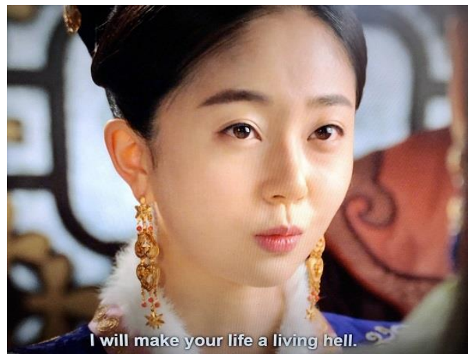
Miss Bingley: Baek Jin-hee, Empress Ki

Baek Jin-hee as Tanshiri, Empress Ki (2014)