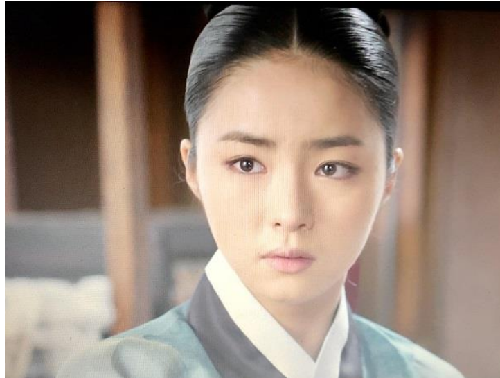
Miss Lucas: Shin Se-kung, Tree with Deep Roots

Shin Se-kyung as Dam, Tree with Deep Roots (2011)