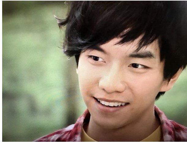
Mr Bingley: Lee Seung-gi, My Girlfirend is a Gumiho

Lee Seung-gi as Cha Dae-woong, My Girlfriend is a Gumiho (2010)