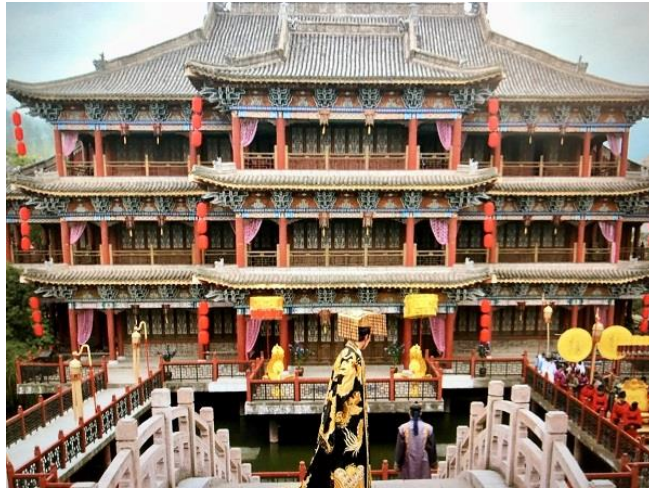
Yongin Daejanggeum Park, filming location for many Korean dramas, such as Empress Ki

Kicking off things, as all good stories should, is a beautiful setting. Like Mr Darcy's grander than grand home of Pemberley in Pride and Prejudice , kdrama makes good use of its filming locations to take our breath away. From its recreated historical buildings ( Empress Ki ), to its modern architecture ( The Greatest Love – the lead male's cool house is in fact a museum), to its sweeping landscapes ( Mr Sunshine ), to its blossom trees (any drama filmed in spring) and snow (any drama filmed in winter), yep, kdrama has its gorgeous settings down.