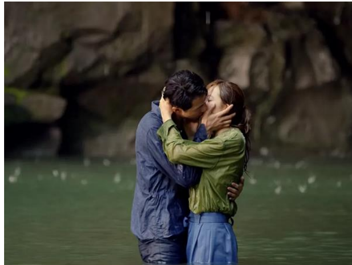
Heartfelt OTP: Jo In-sung and Gong Hyo-jin, It's Okay, That's Love

Where would any story be without flawed, brilliant characters? And where would kdrama be without its stellar actors? Chuno just wouldn't be as compelling without (deafening squeeEEEEEE) Jang Hyuk playing Lee Daegil. It's Okay, That's Love without Jo In-sung's heartfelt portrayal of Jang Jae-yeo wouldn't make the fantastic OTP half so glorious.