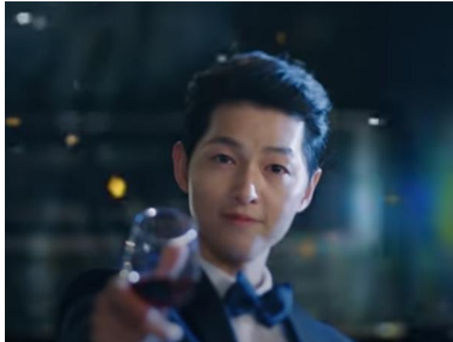
Swoon: Song Joong-ki, Vincenzo

scant touch of hands, a longing, lingering utterance of their name. The sort I can squeeEEEE over (and I do a lot of squeeing). Just as I adore Jane Austen stories, I too find a cosy kind of comfort in kdrama, in the restrained but powerful story of love.