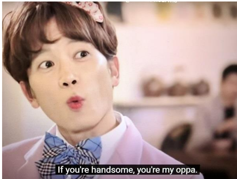
Lydia Bennett: Ji Sung, Kill Me, Heal Me

Ji Sung as Ahn Yo-na, Kill Me, Heal Me (2015)