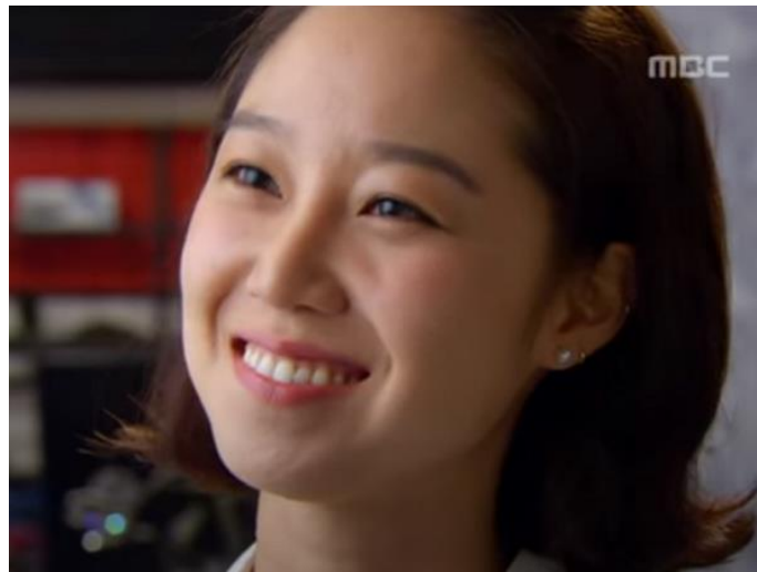
Jane Bennett: Gong Hyo-jin, The Greatest Love

Gong Hyo-jin as Gu Ae-jung, The Greatest Love (2011)