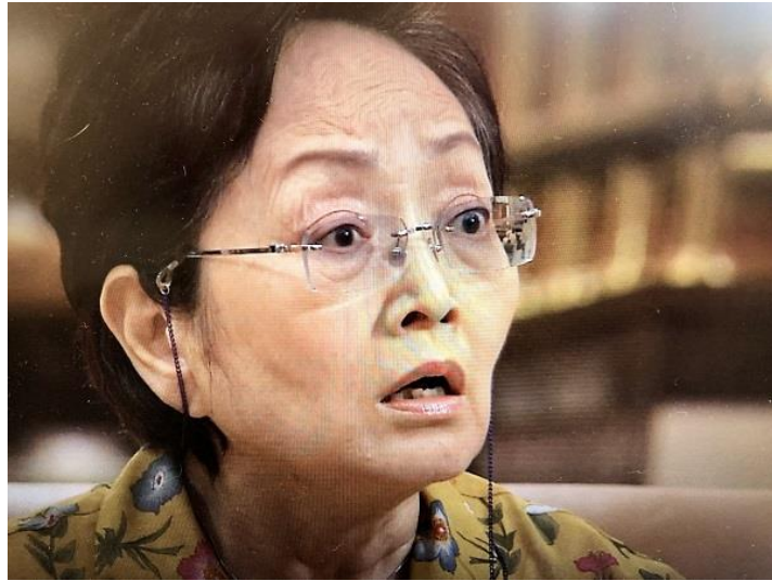
Lady Catherine de Burgh: Kim Young-ok, Coffee Prince

Kim Young-ok as The Grandmother, Coffee Prince (2006)