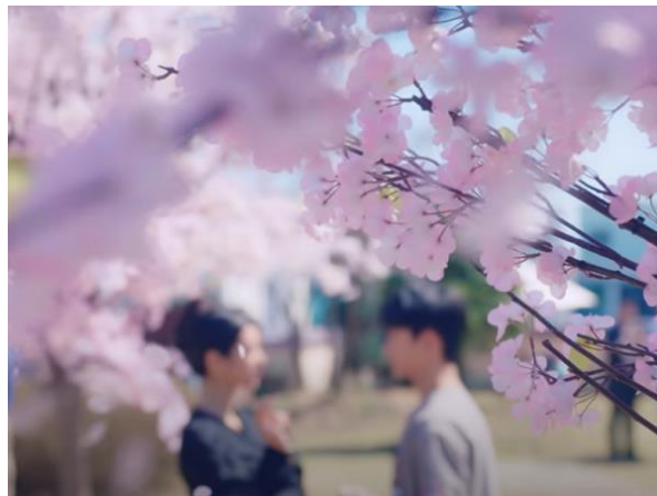
Romance is blossom trees: Soo Yea-ji and Kim Soo-hyun, It's Okay Not to Be Okay

And so begins one of the most famous stories ever told – Pride and Prejudice by Jane Austen, first published in 1813 and adapted into countless TV shows and films ever since – even one that includes zombies. And my go-to when I need a pick me up. It is, for me, a comfort blanket – and I’ve discovered, so too is kdrama.